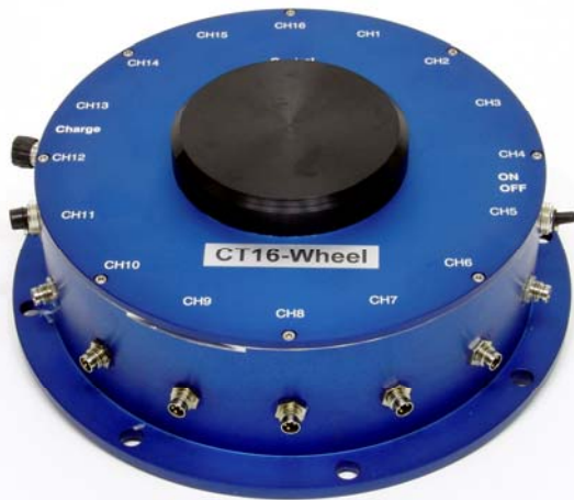
Encoder in IP65 Aluminum housing