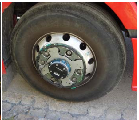
Application pictures of CT8-Wheel