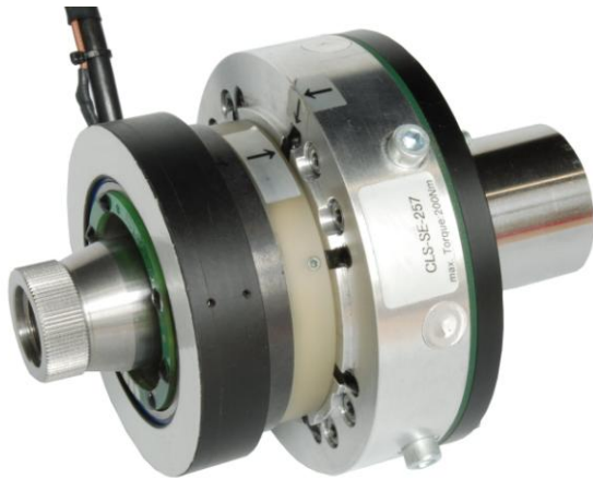
Small, flexible and high-precision: The new steering effort sensor KMT-CLS