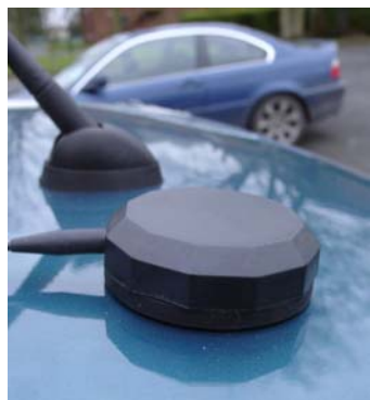
Magnetic GPS antenna for vehicle mounting. Other types available.

The internal processing includes the strapdown algorithms (using a WGS-84 earth model), Kalman filtering and in-flight alignment algorithms. The internal Pentium-class processor runs QNX real-time operating system to ensure that the outputs are always delivered on time.